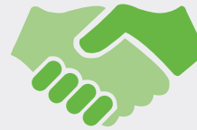
Figure out what you need to get the most out of your efforts.