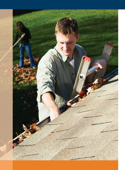
First Accident Benefit pays you $100 immediately.